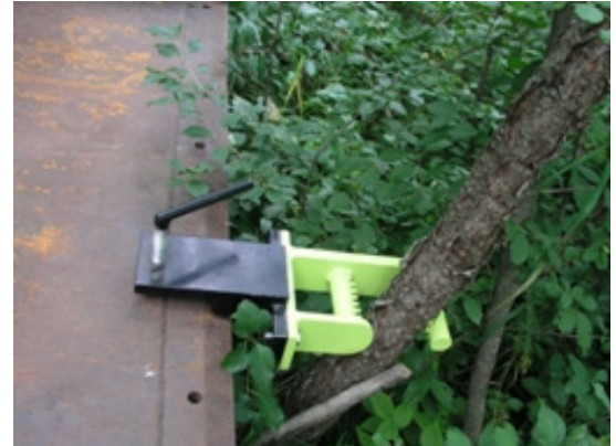
*BG-23 Bucket Mount shown sold separately